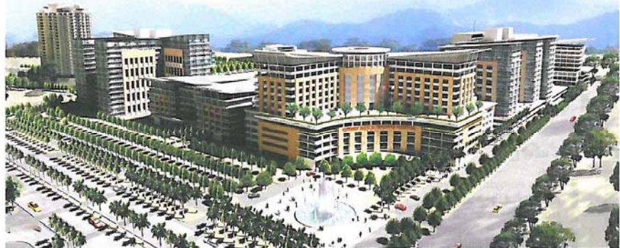
An artist's impression of the International Hi-Tech Healthcare Park

Government backing for the healthcare park project is strong. Says Lai, "It is willing to work with foreign investors to expedite approvals and work permits for foreign staff. The government is allowing import of fixed asset equipment with no import duty or value-added tax." It grants a tax holiday in the first four years,