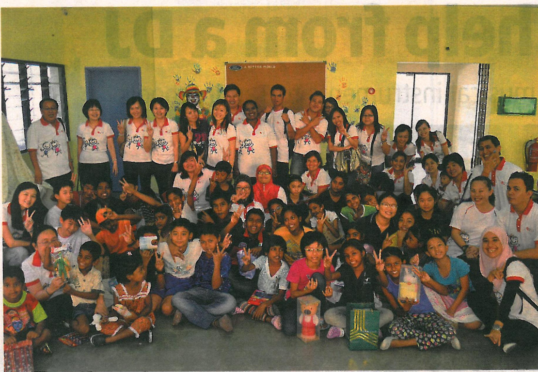
Bonding opportunity: Ireka Cares volunteers having a fun time getting to know the children from Rumah Hope.