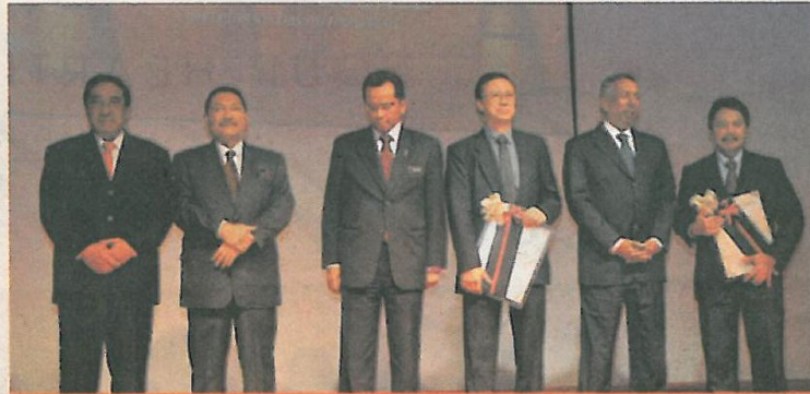
The MCIEA 2010 panel of judges posing on stage with Y.B. Dato' Shaziman Abu Mansor, Minister of Works

The Malaysian Construction Industry Awards are Malaysia's premier accolades for all-around excellence in the industry.