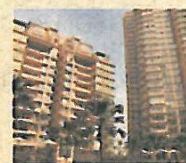
Kiaraville, Mont' Kiara