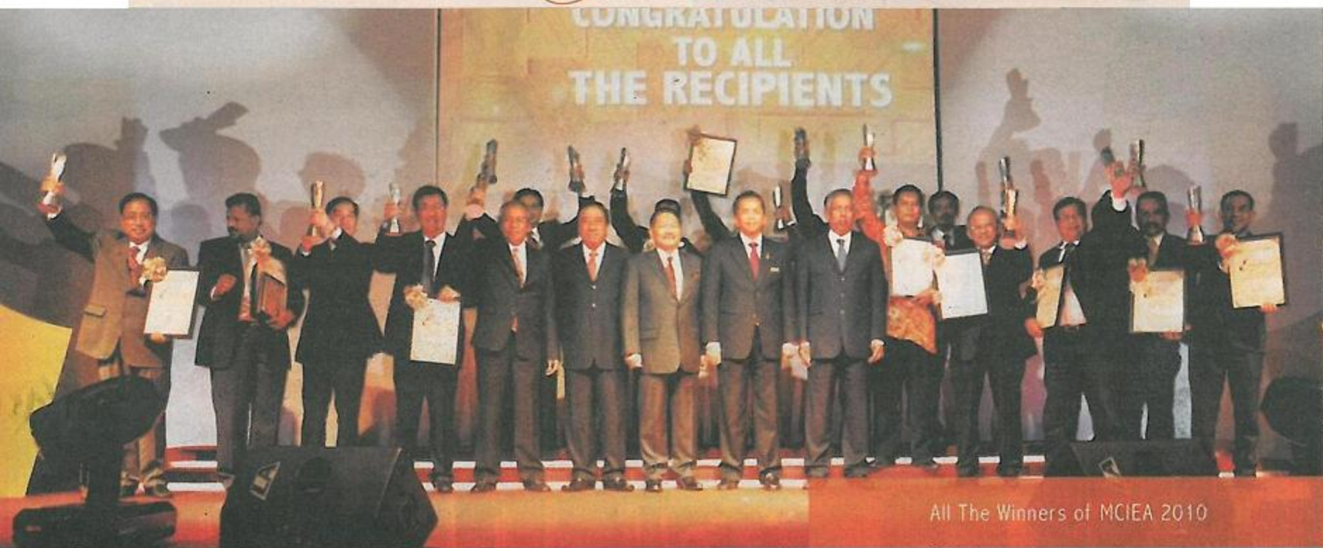
All The Winners of MCIEA 2010