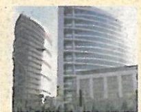
Putrajaya Govt Offices