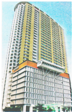
The tower block of i-ZEN@Kiara I reaches up 35 storeys high. There are 12 units per floor, serviced by three lifts for residents plus an extra service lift.

"There was clearly a market for such units as there was a growing demographic of single professionals or executives who worked long hours and liked a home that was well located, did not require too much upkeep and yet trendy,