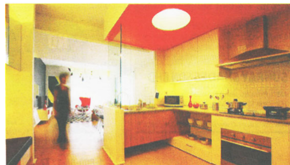
The front door opens to the kitchen in this 82sq m (913sq ft) two-bedroom unit.