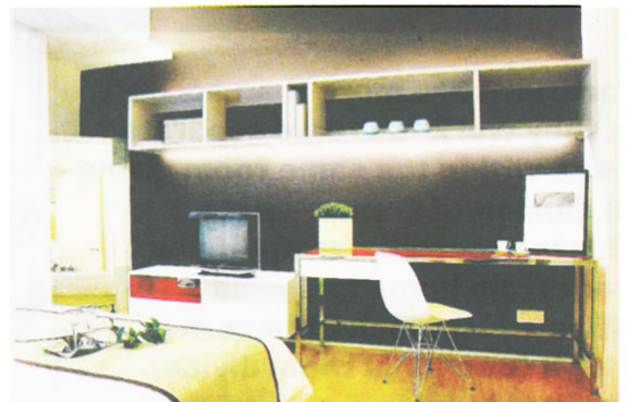
This 73sq m (804sq ft) one-bedroom unit, comes with built-in features that are "floated" and elongated to enhance linear space.

that does not share any party walls with any other unit. All units also come with external yard that allows for heavy-duty cleaning and drying of clothes.