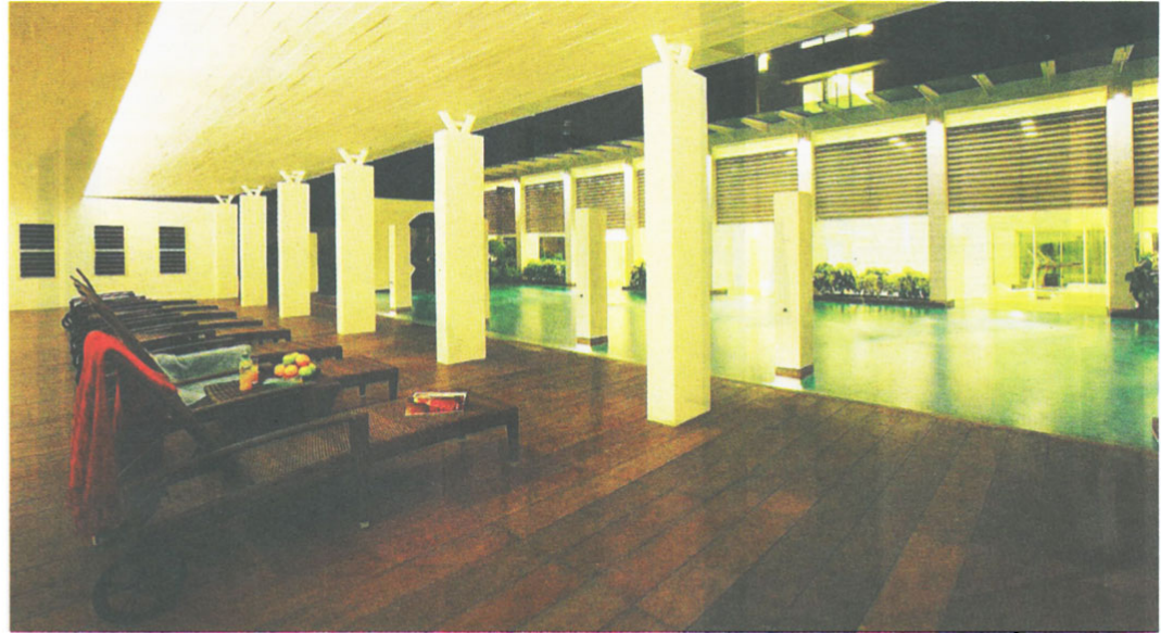
The Floating Chill-out Deck offers a stylish place to relax by the swimming pool.