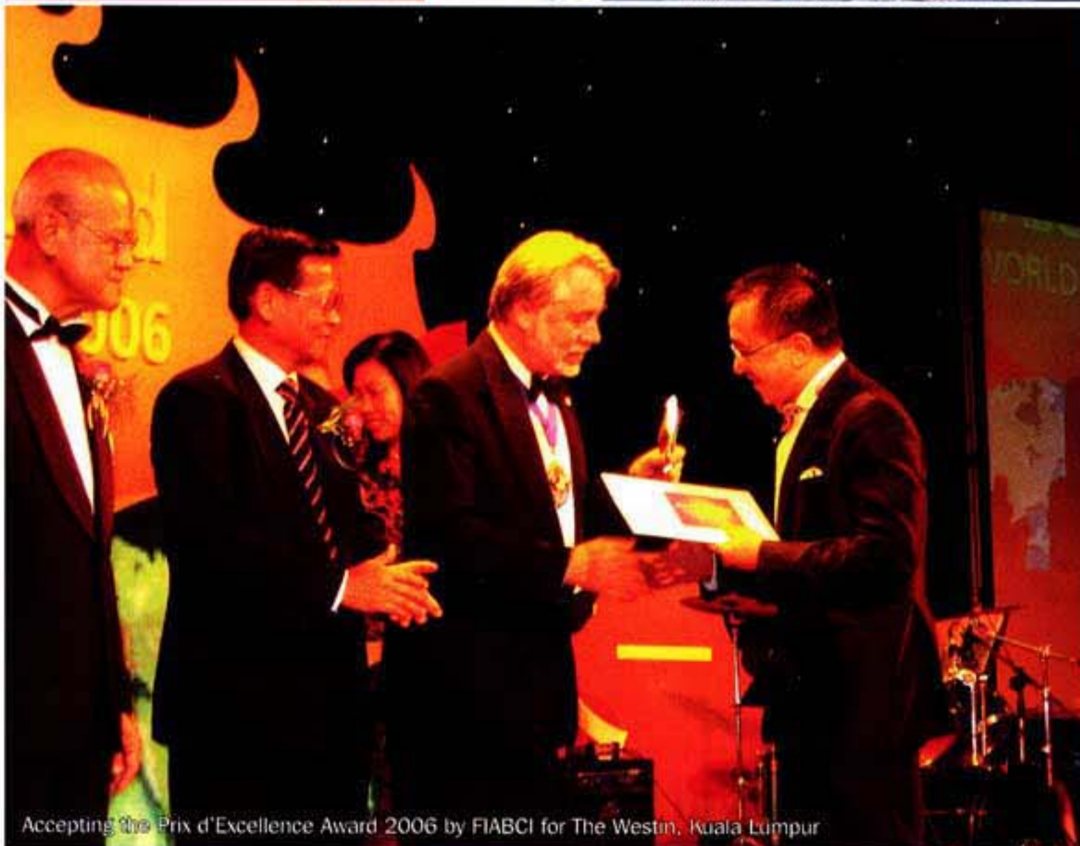
Accepting the Prix d'Excellence Award 2006 by FIABCI for The Westin, Kuala Lumpur