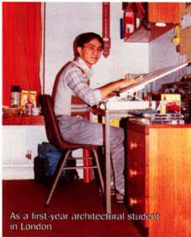
As a first-year architectural student in London

"SOMETIMES CIRCUMSTANCES GIVE YOU THE OPPORTUNITY TO LEARN. I AM VERY FORTUNATE INDEED"