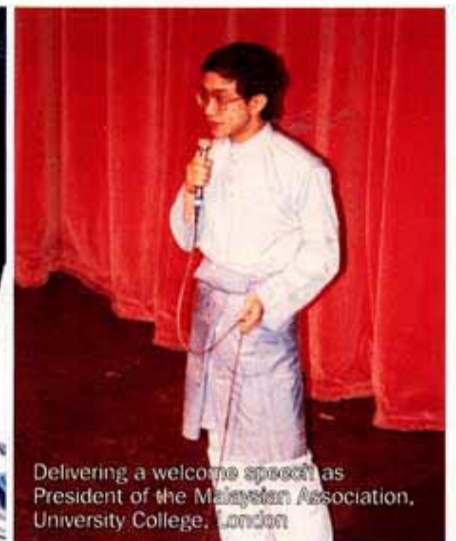
Delivering a welcome speech as President of the Malaysian Association, University College, London