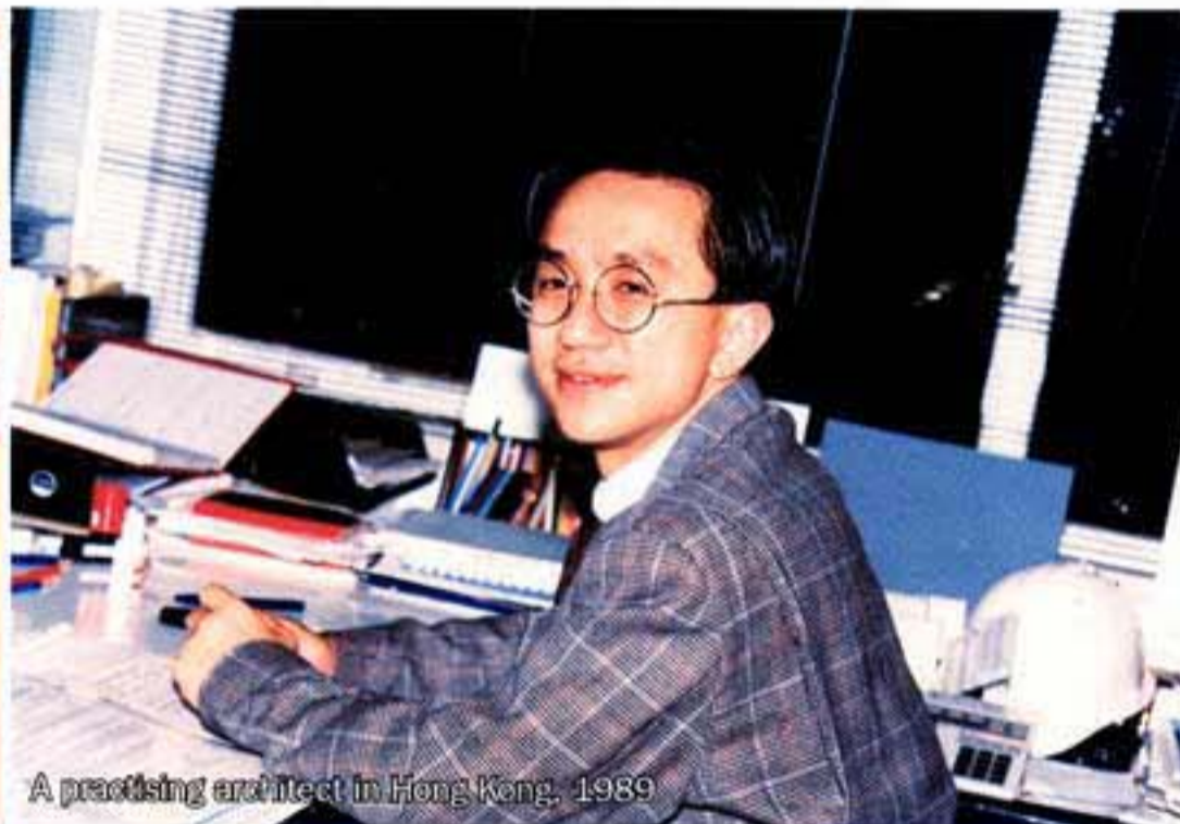
A practising architect in Hong Kong, 1989