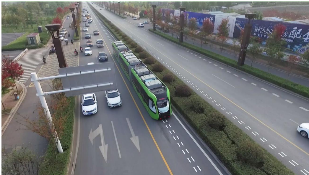
The operation of the Automated Rapid Transit System in China